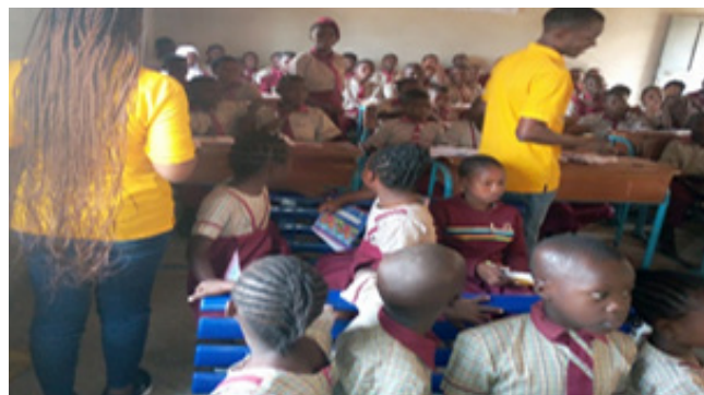
A. LEADERSHIP ACADEMY, MASAHA, NASARAWA, FEBRUARY 2020