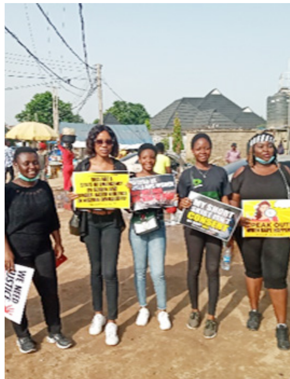
B. COLLABORATION WITH JADE OLISE FOUNDATION ON GBV DURING COVID 19 PANDEMIC, JUNE 2020