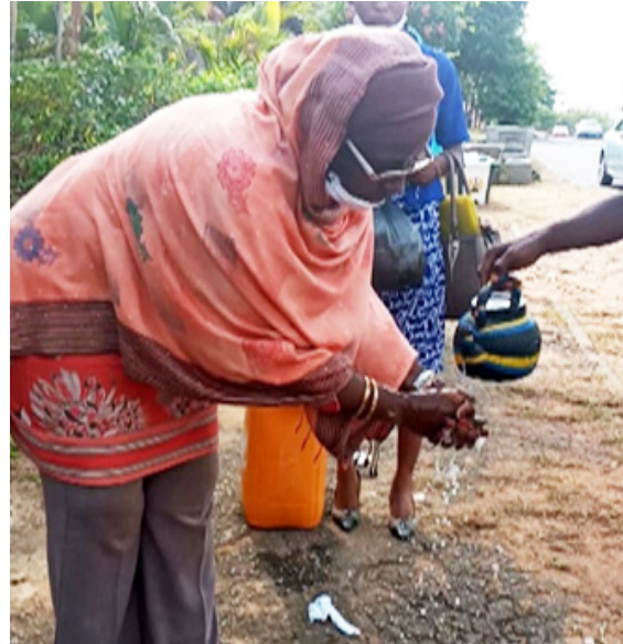
A. SENSITIZATION ON COVID 19 SAFETY TIPS FOR HAWKERS AT POWER JUNCTION, FCT, MARCH 2020