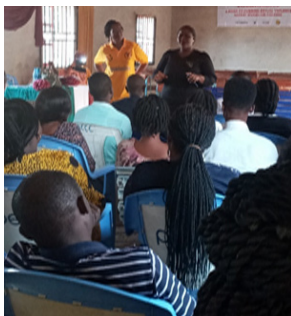
SENSITIZATION OF PARENTS